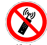
mobile phones prohibited