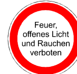
fire, naked light and smoking prohibited