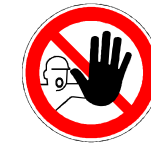
no unauthorized persons may enter