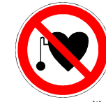
no persons with pacemakers may enter