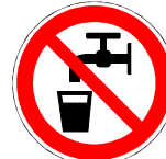
no drinking water